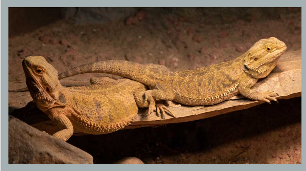
Spike and Preston