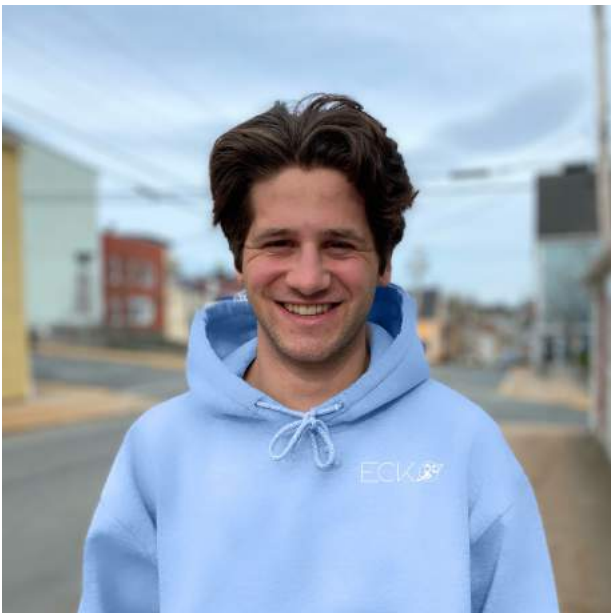
logistics EDII coordinator

My favourite O Week memory is definitely coverall painting because it's when everyone feels most comfortable with their groups and it also really reminds me of my time as a first-year in Kin.